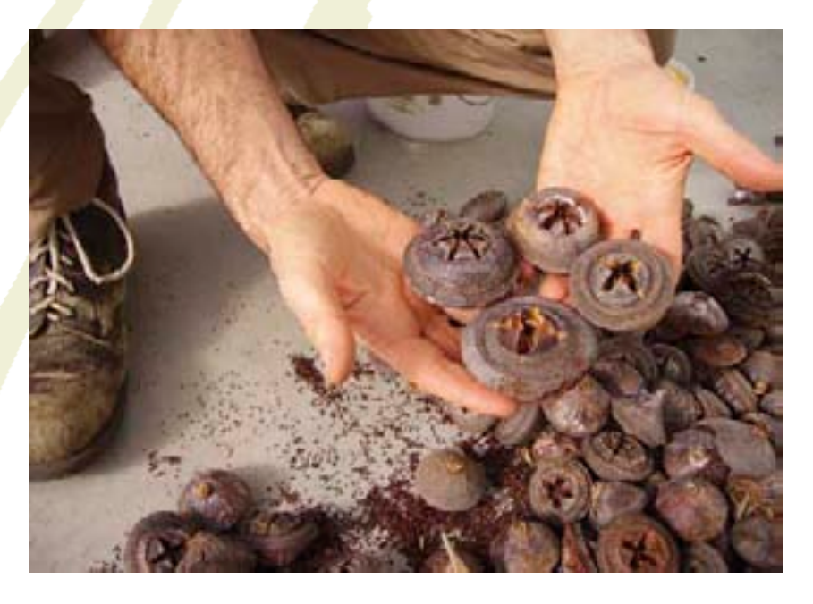
Collecting Eucalyptus macrocarpa fruits and seed for revegetation, Western Australia.